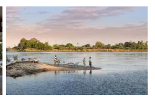
Day 7-10 African Bush Camps Somalisa Camp, Hwange National Park