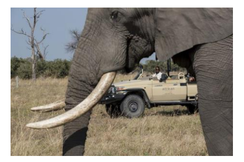
Day 4-7 African Bush Camps Thorntree River Lodge, Victoria Falls (Zambia)